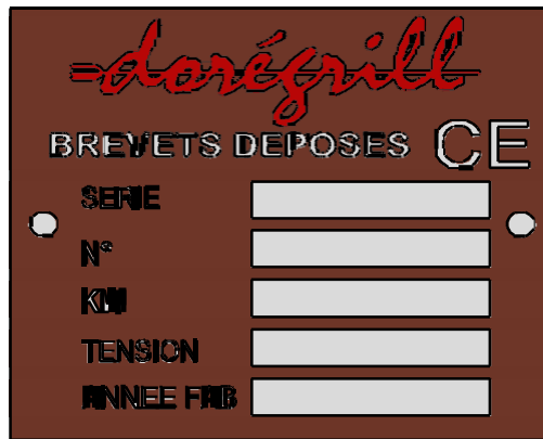
Fig. 1 (EC labelling)

This panel is attached to the left hand side of the rotisserie oven, on the bottom of the technical cabinet door (15).