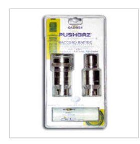
AC 6 PUSHGAZ

Stainless steel wheeled cart for preparation and storage before cooking (supplied without spits).