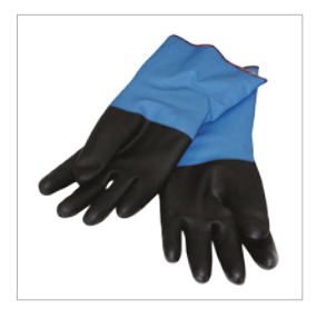
AC 25 SPECIAL HIGH-TEM-PERATURE GLOVES

Ultra powerful product for cleaning baked-on fat. Free spray gun with the purchase of 2 bottles. Complies with current regulations. (Available in 1 and 5 liters).