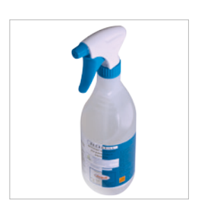
AC 8 "DECAGRILL" PRODUCT

Ultra powerful product for cleaning baked-on fat. Free spray gun with the purchase of 2 bottles. Complies with current regulations. (Available in 1 and 5 liters).