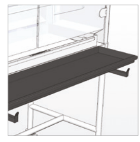
AC 34 SLIDING MEAT REMOVAL TRAY

Mid-level tray with brackets, used to cook vegetables (potatoes, etc.). Lets you partition the rotisserie oven.