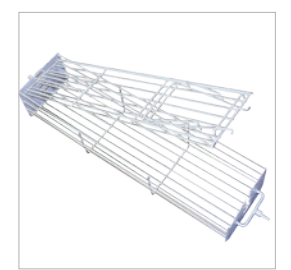
AC 21 MULTIPLE-USE BASKET

Basket specially designed to cook chicken legs, half-chickens, spring chickens, spare ribs, pork belly, ham knuckles, ham hocks, small cuts and roasting joints.