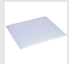
AC 2 WORK TABLE