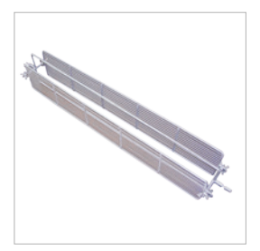
AC 13 ENGLISH-STYLE SPIT

Spit used to cook spare ribs, pork belly, chicken legs, half-chickens, roasting joints and shoulders.