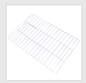
AC 5 STAINLESS STEEL WIRE RACK

Stainless steel raised unit with tray, fitted with a mixer and hose. Backplate with spit supports.