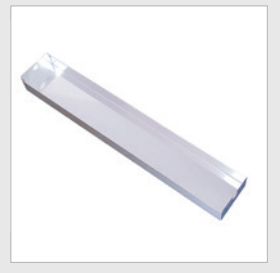
AC 9 DEEP TRAY

Stainless steel roof adapted for outdoor rotisserie ovens.