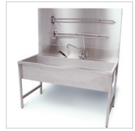
AC 24 CLEANING MODULE

Filtering extraction hood, connects to existing ducts. For more information, contact our technical department.