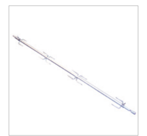
AC 15 SPIT WITH FORKS

A spit designed for roasting ham hocks, ham knuckles, legs and more.