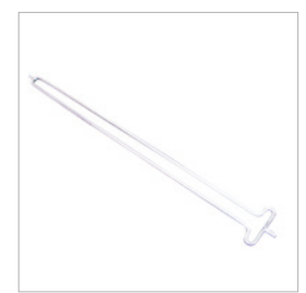
AC 20 SIMPLIFIL® SPIT