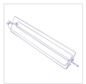
AC 17 LARGE-ITEM SPIT

A fork spit for all types of spit used to cook lamb legs, capons, turkeys, etc.