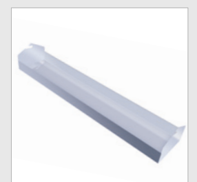
AC 26 LARGE-SCALE STAINLESS STEEL TRAY