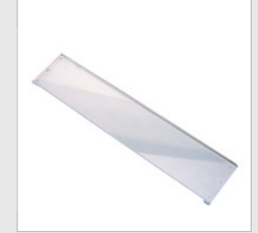
AC 10 SHALLOW TRAY