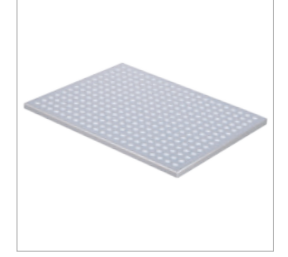
AC 19 SPLASH GUARD

Removable stainless steel tray mounted on 2 retractable runners (order at the same time as the rotisserie oven).