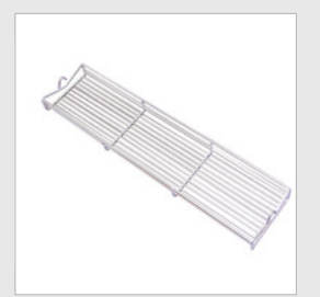
AC 12 LEG BASKET