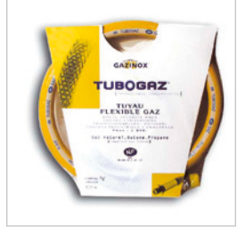
AC 7 TUBOGAZ

Fast and easy gas connection for rotisserie ovens.