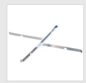
AC 3 ANTI-WAVE SYSTEM FOR FAT TRAY

Sliding polyethylene work table, adaptable for the AC-1 cart.