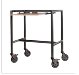
AC 1 SUPPORT CART

Erbium-finished round tube cart with 4 Ø 125mm wheels and 2 with brakes (AC 2 table is available as an optional extra).