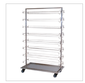
AC 22 2X8 SPIT STORAGE CART

Stainless steel cart on wheels with a removable upper tray and lower shelf.