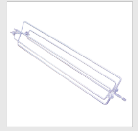
AC 17 LARGE-ITEM SPIT